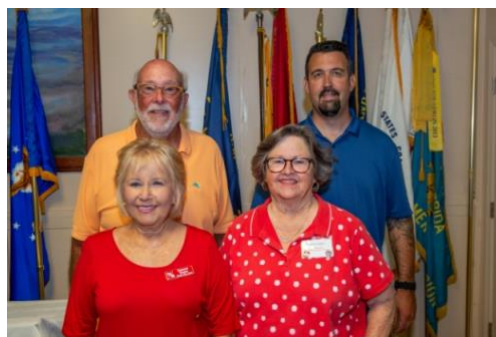
NEW 2022 MKRC OFFICERS